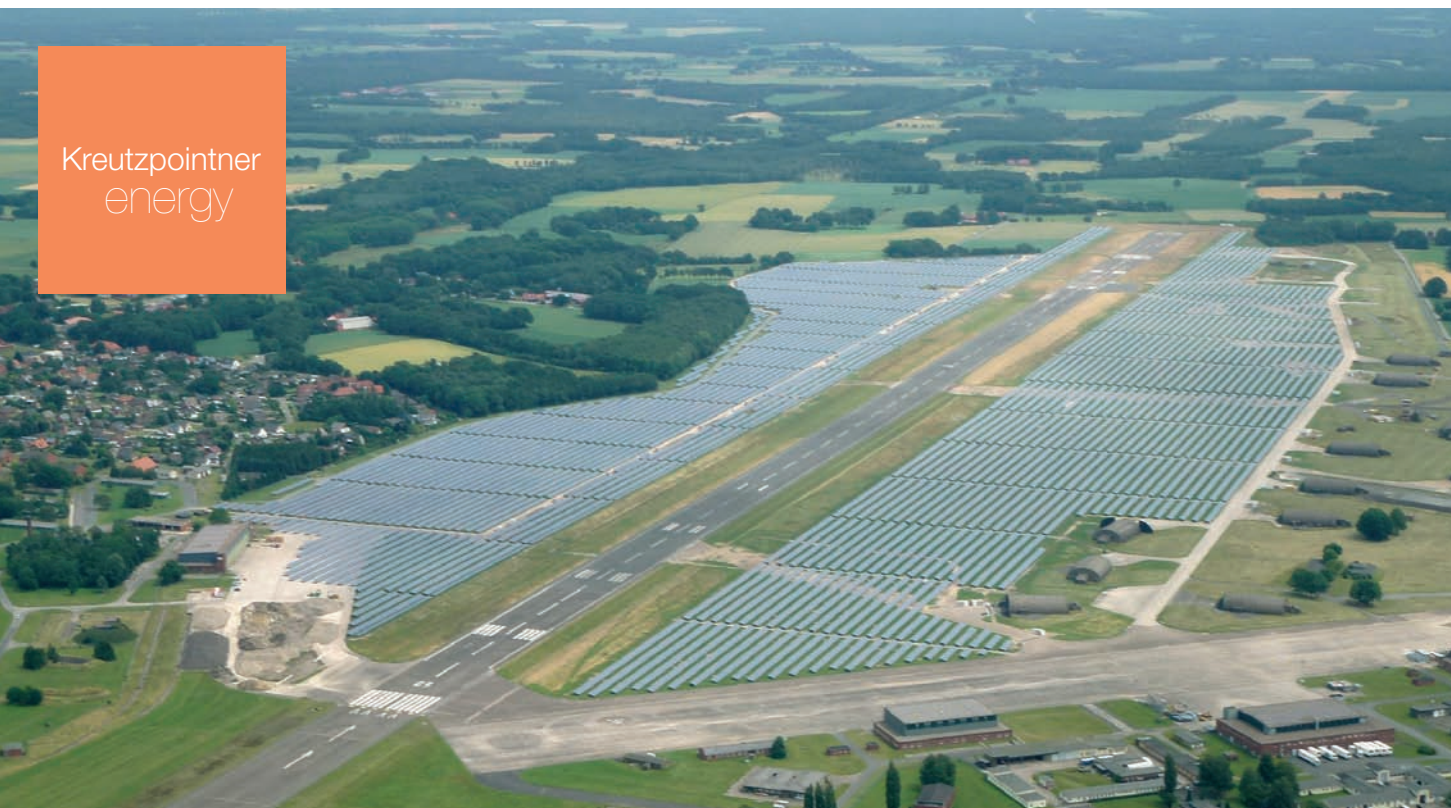
51 MWp solar park in Ahlhorn, Lower Saxony